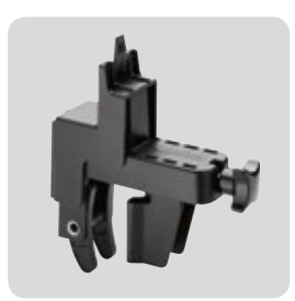
Stable and robust universal bath attachment clamp