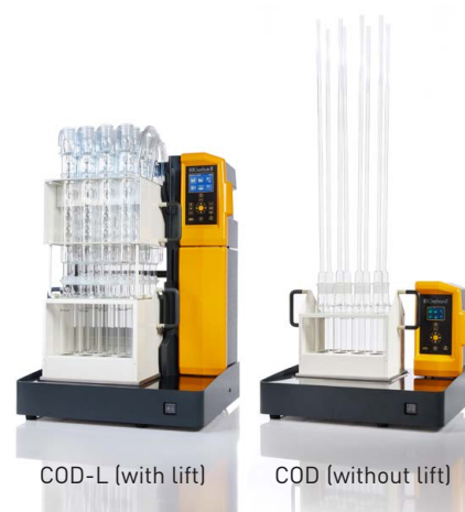
COD-L (with lift)

2) 230 V version, special voltages on request