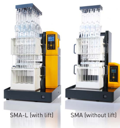
SMA-L (with lift)

2) 230 V version, special voltages on request