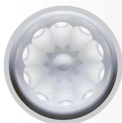
Dividing head 1:10