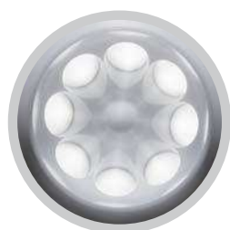
Dividing head 1:8