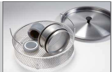
LABORETTE 17 Size I

Simple operation to clean the sieves, they are simply placed or positioned in the cleaning liquid.