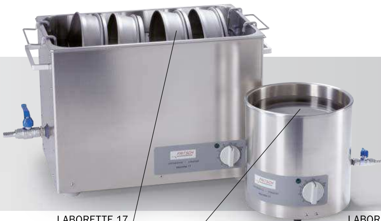
LABORETTE 17 Size II