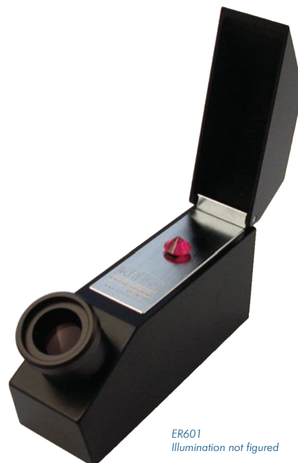
ER601 Illumination not figured

Gemstone refractometers are used for the classification and quality control of gemstones. The gemstone to be examined is simply placed on the prism with a drop of contact fluid. The refractive index of the gemstone is read through the ocular of the refractometer. The refractive index is an important parameter in classifying a mineral or gemstone. Each mineral has its typical refractive index, due to its chemical composition and crystalline structure. Our gemstone refractometers are characterised by their particularly sharp image and good readability. With the sodium filter that only lets through light with a wavelength of 589 nm, the refractometer can be used as a mobile unit with an ordinary light source or with sufficient ambient lighting. LED illumination is also available with a wavelength of 589 nm.