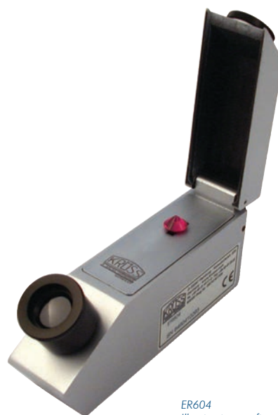
ER604 Illumination not figured